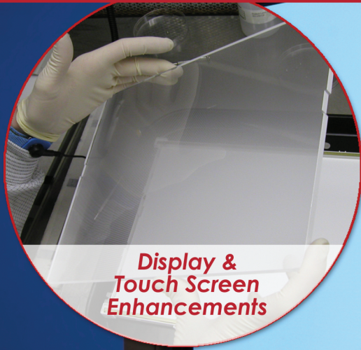
Display & Touch Screen Enhancements